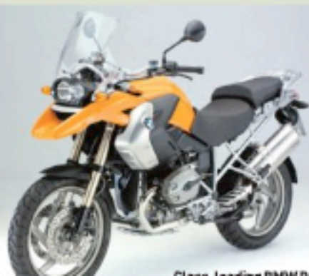
Class-leading BMW R1200GS

Here are the standout models the new Yamaha will be up against when it goes on sale next year.