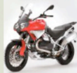
Stelvio beats BMW for flair

"The BMW GS represents about half of BMW's total production, so there is an opportunity for us to do well with this bike."