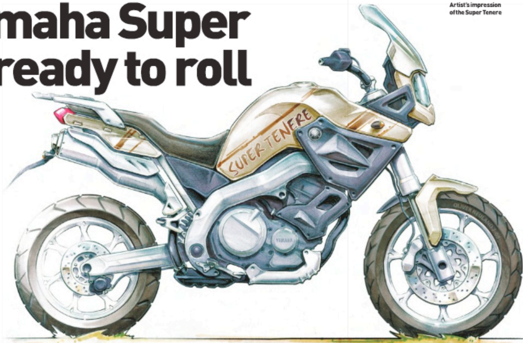
Artist's impression of the Super Tenere

The fuel tank will have capacity of well over 20 litres